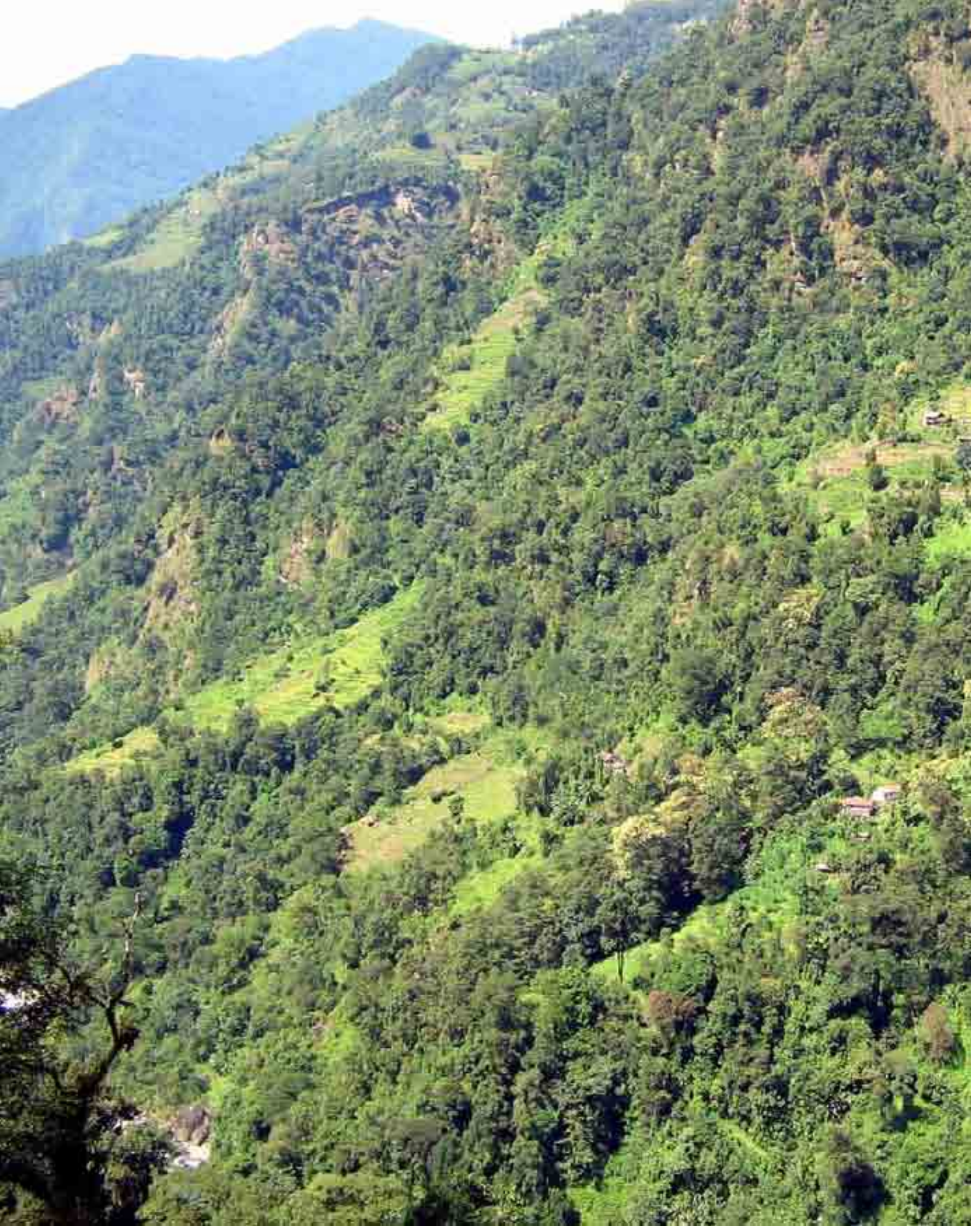
Households on scattered mountain terrain pose a challenge for provisioning of basic amenities and services