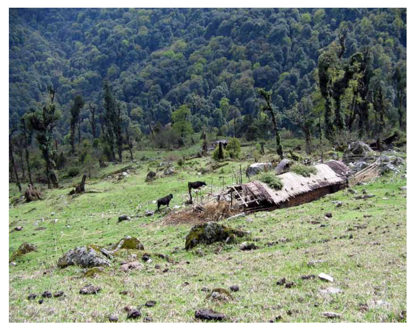
The age old practice of agro-pastoralism where herders managed cattle sheds inside reserve forests, resulted in large scale fragmentation of temperate forests. Over the last ten years, these cattle sheds have been phased off giving a new lease of life to these biodiversity rich forests

air and land environment and create paradigms by way of which cleaner environment can trade its clean quota which is over and above the permissible limits and earn credits. Also climate monitoring at high resolution within Sikkim is also an important aspect of understanding the likely impacts of climate change on various systems, which needs to be introduced with setting up of automatic weather stations, transferring data remotely to a centre which does on line processing and disseminating to all stakeholders, along with seven day forecast and has the capacity to undertake climate modeling for future long term projections of climate and its impact on various systems and sectors.