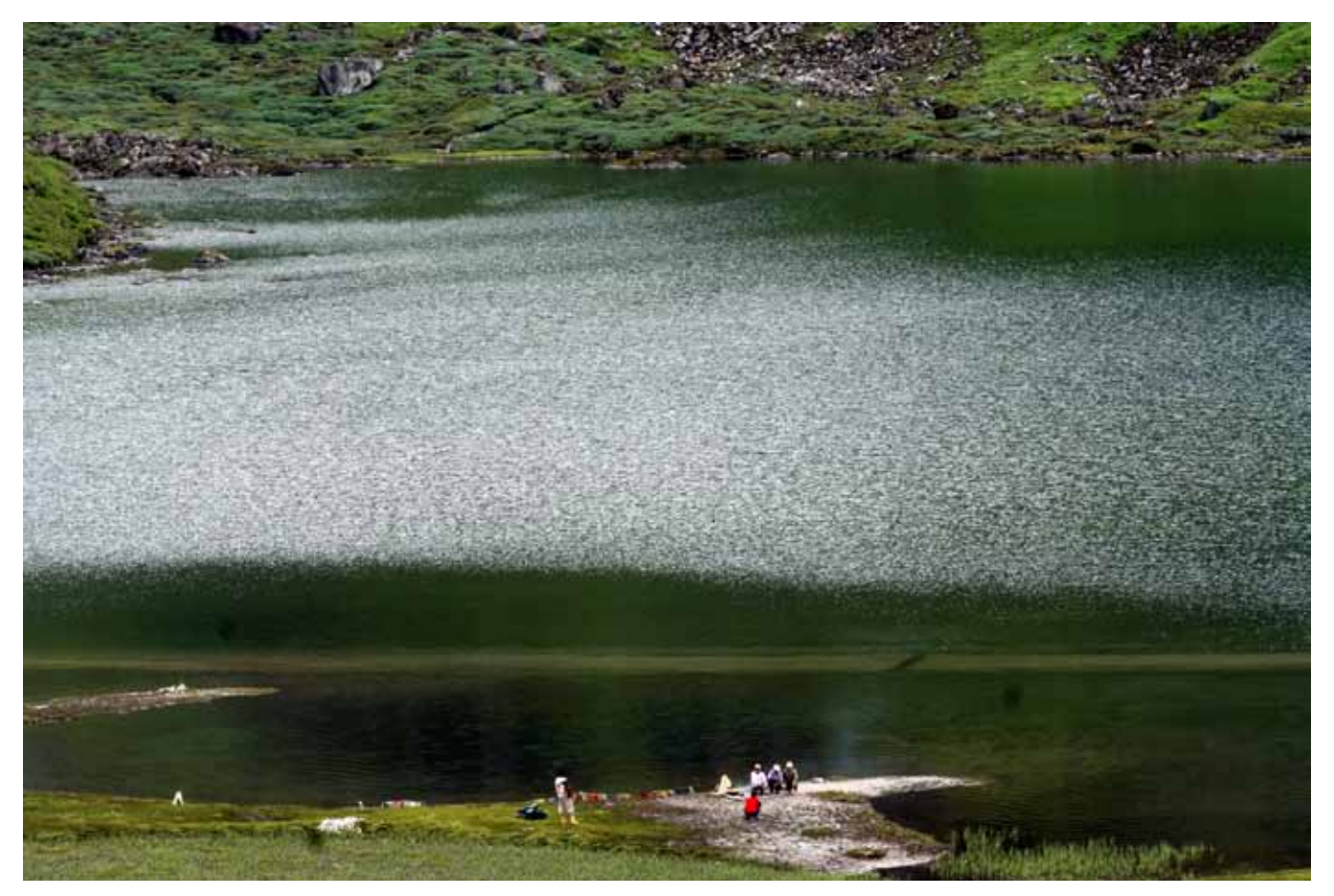
Kishong sacred lake in Upper Dzongu, North Sikkim. Mountain lakes play a vital role in recharging ground water and need to be preserved