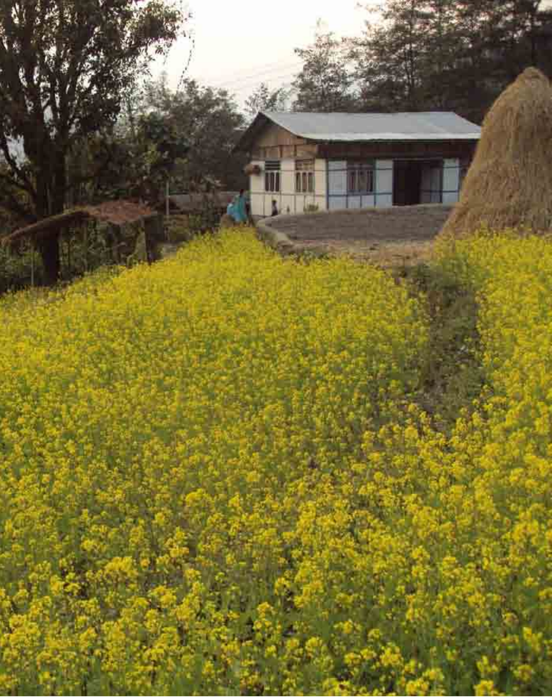
Traditional rabi crops like mustard are being promoted to adapt to the warmer and drier winters