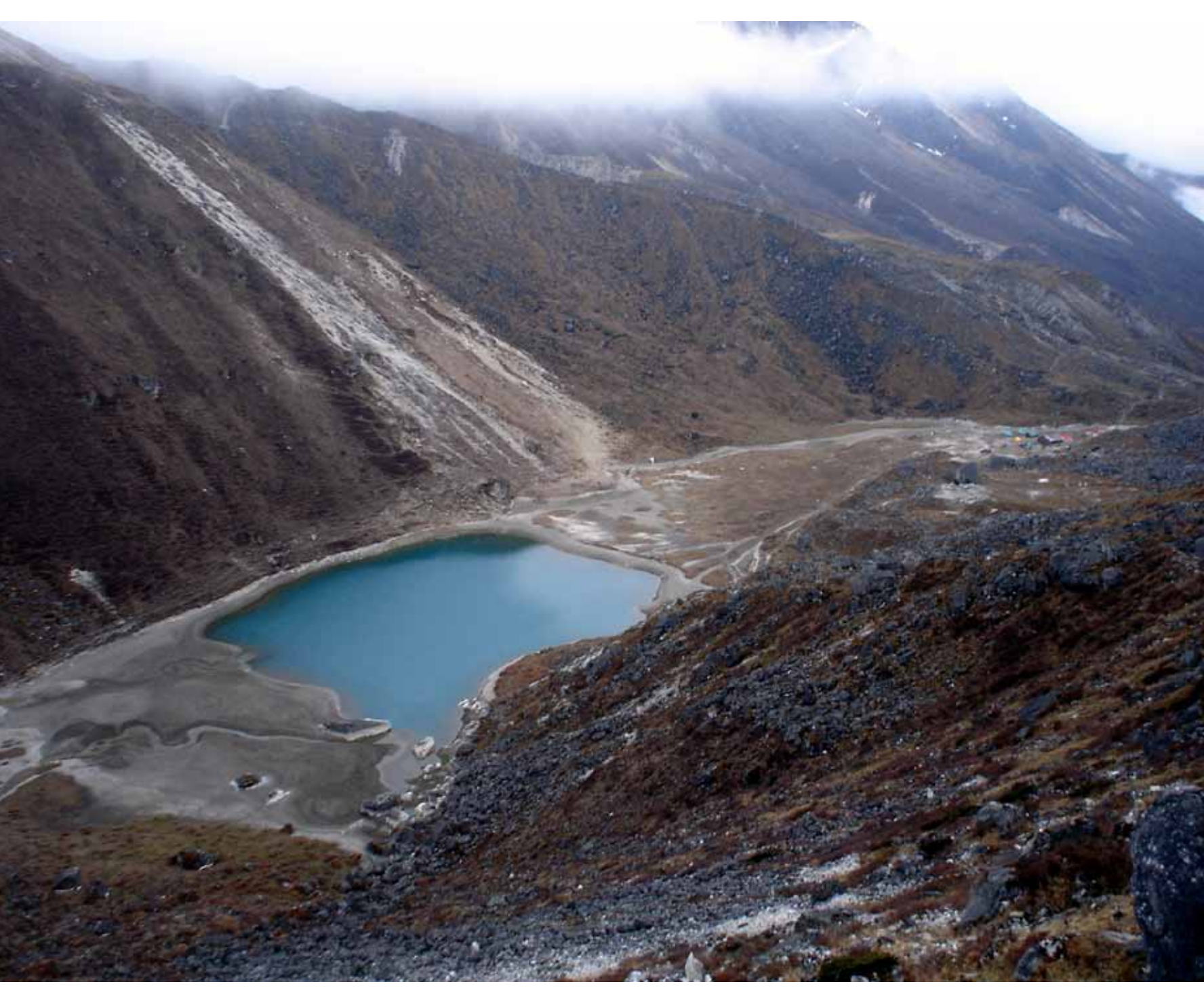
Sungmoteng Tsho (Samiti lake) in West Sikkim. Conservation of high altitude wetlands is vital to secure the services provided by the wetland ecosystem

C K Rao Independent Consultant Email:raoveni@gmail.com