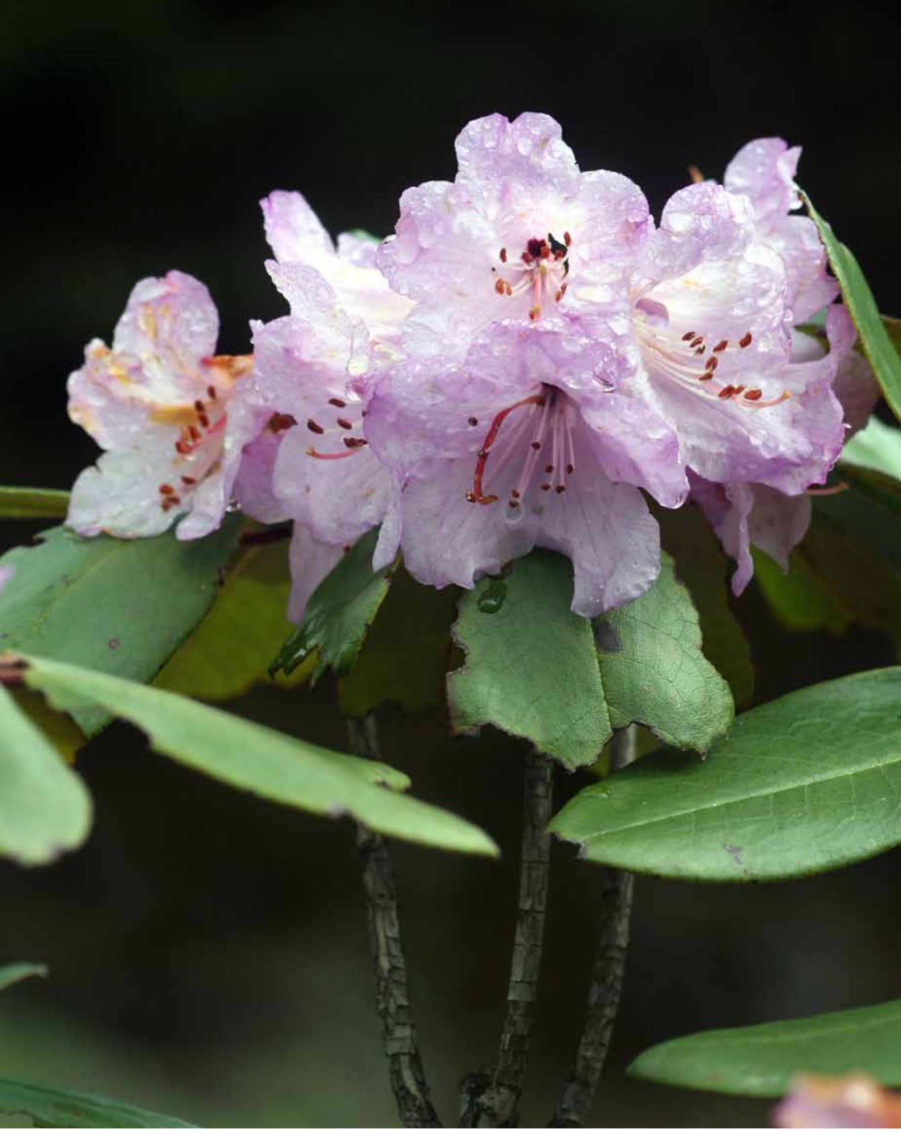
Rhododendron campanulatum is found near the tree line of sub-alpine silver fir forests