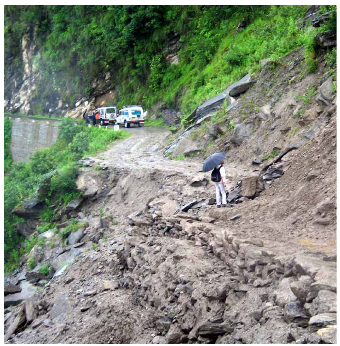
Weak geology, heavy rainfall and steep terrain make the state specially prone to frequent landslides resulting in enhanced vulnerability during the monsoon season

however, it is recognised that they were from the Department of Science and Technology and Climate Change, Rural Management and Development Department, Water Security and Public Health Engineering (PHE) Department, Irrigation and Flood Control Department, Food Security and Agriculture Department, Animal Husbandry Livestock and Fisheries & Veterinary Service Department, Horticulture and Cash Crop Department, Forest Department, Energy and Power Department and WWF Sikkim.